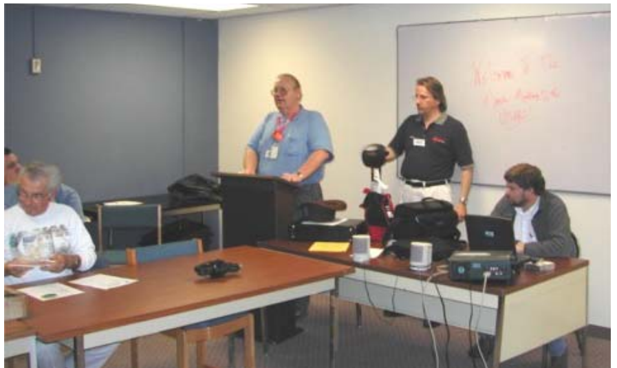
In 2003, NPSARC meetings were hosted by the Veteran's Transition Center.