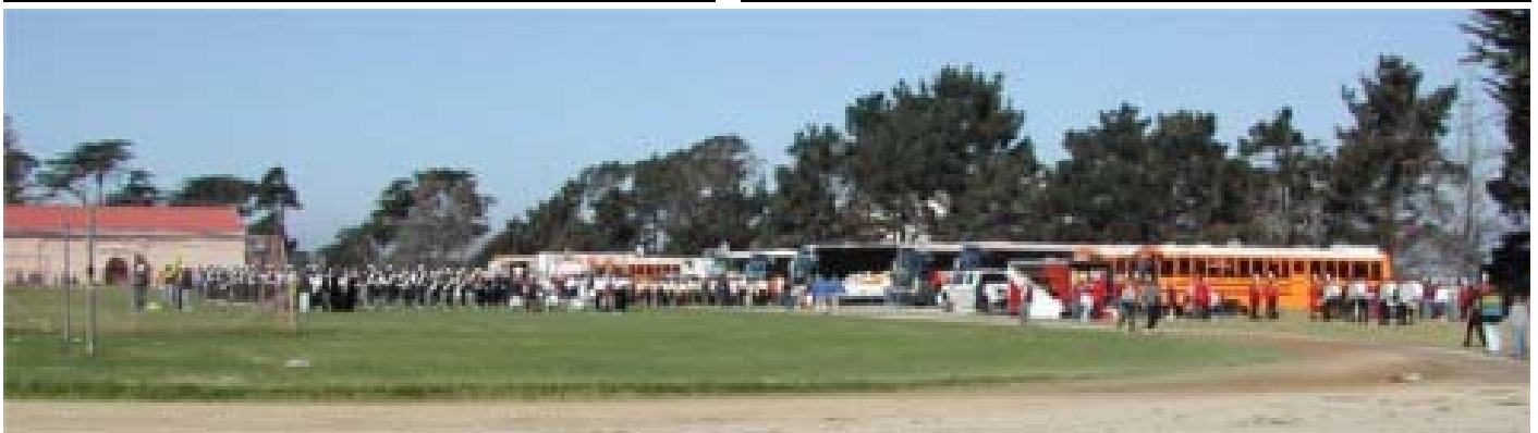
The 2003 PG Marching Band Festival featured dozens of bands, hundreds of busses, thousands of participants, thousands of spectators, and ham radio. The PGMBF provides us with an outstanding training opportunity as we serve our local community.