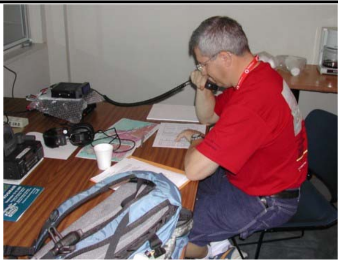
WV1B handles the net at Net Control for the PG Triathlon, an olympic qualifier event. Hams provide support at the swim, and along the bike and running courses.