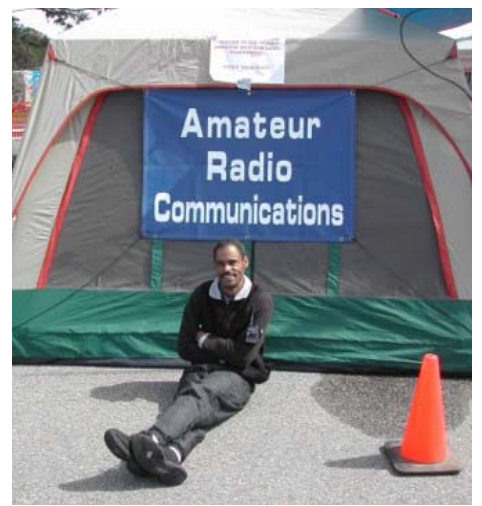
KE6NLP on a break from BSIM action at Staging—our alternate CP, alternate NCS, Intel Center, and logistics base.