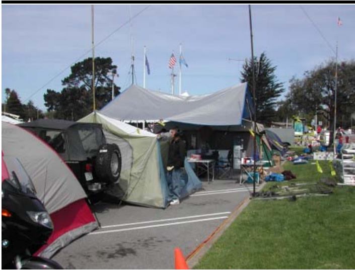
Staging, the 2003 Big Sur International Marathon. The BSIM receives command, control, communications, and intelligence (C3I) support from local hams, coordinated by CARTOG.