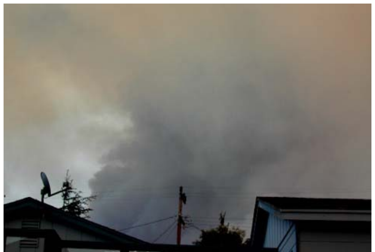
Hams prepare for emergencies throughout the year. In 2003, we just missed being in the middle of one when firefighters stopped the uncontrolled burns at Fort Ord just short of Gen Moore Road.